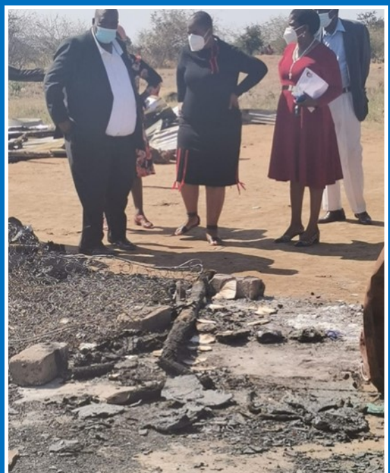
Bottom right: Inspecting what is left of the dwelling of the Lephale family.